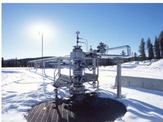
This natural gas line is just one of many that is in operation across North America.

Described by New York times as this century's gold rush, natural gas has been deemed the solution to North America's dependency on foreign fuel sources. With the recent development of new extraction techniques, drilling companies have been